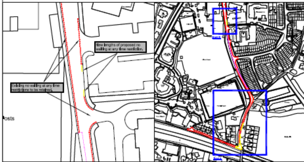
Inset B Scale: 1:250